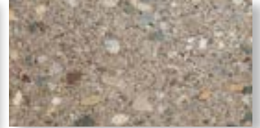
315 CLAY BUFF