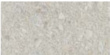
754 GLACIAL WHITE