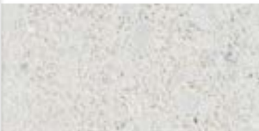
759 ICE WHITE