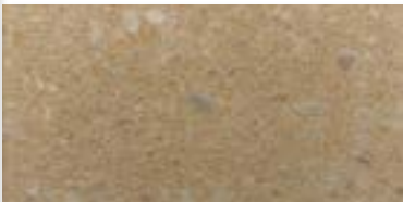
740 LIME ROCK