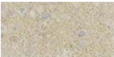
795 BUFF KASOTA