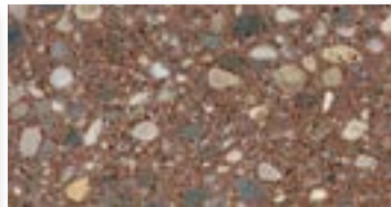
358 BRICK RED