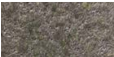
951 ONYX (Designer Plus Series)