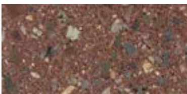
509 CHOKE CHERRY