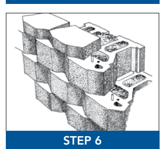
Capping the Wall.

Place the straight fiberglass pins into the holes of each Keystone unit as required. Once placed, the pins create an automatic setback for the additional courses. Place fiberglass connecting pins in the front holes for near vertical (½" or [3mm]) setback and in the rear pin holes for 1½" (29mm) setback per course.